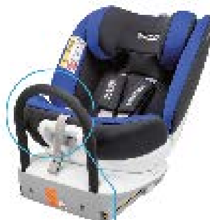
U-shape rebound bar Anti-overturning function