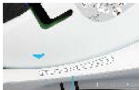
Adjusted in three positions Footrest can be adjusted in three positions both forward and rearward facing