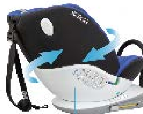
360° rotation The car seat rotates 360 with unlimited smooth rotation and one button to easily adjust the angle, no sticking guaranteed