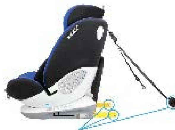
Isofix system Compatible with both ISOFIX and non-ISOFIX cars: for ISOFIX cars, the seat connects directly to the ISOFIX and up to the anchorage points