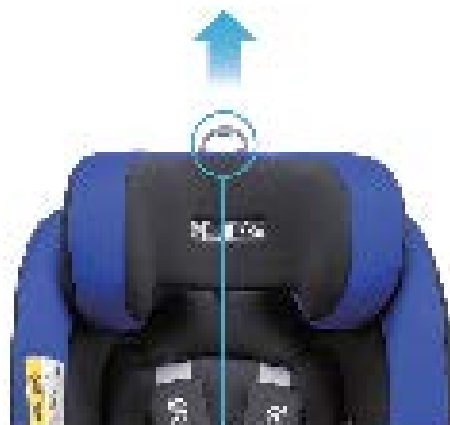
Height-adjustable head rest Headrest is adjustable at 14 steps